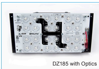
DZ185 with Optics

The unique design of the patent pending FlexMount™ System gives the Diamonz Retrofit series the ability to easily retrofit a majority of fixtures whether it is a vertical or horizontal installation.