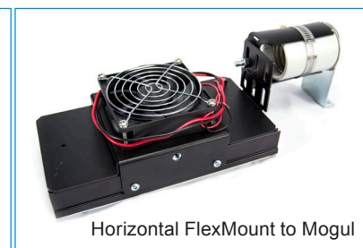
Horizontal FlexMount to Mogul