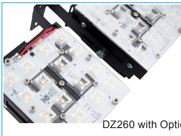
DZ260 with Optics

The unique design of the patent pending FlexMount™ System gives the Diamonz Retrofit series the ability to easily retrofit a majority of fixtures whether it is a vertical or horizontal installation.