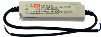
DV40 Non-Dimmable Driver