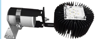
Horizontal Bracket (DLC Wall Packs)